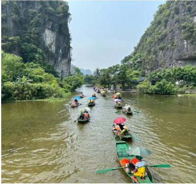
Tam Coc grottoes

Registered office: Villa 09, 310 Minh Khai Street, Minh Khai Ward, Hai Ba Trung District, Hanoi, Vietnam Trading office: 5th Floor, HH01 Building, New Horizon City, 87 Linh Nam street, Mai Dong Ward, Hoang Mai District, Ha Noi city, Viet Nam Tel: +84 24 3941 3748/ 49/ 50