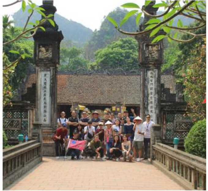
The Temple of Dinh & Le dynasty