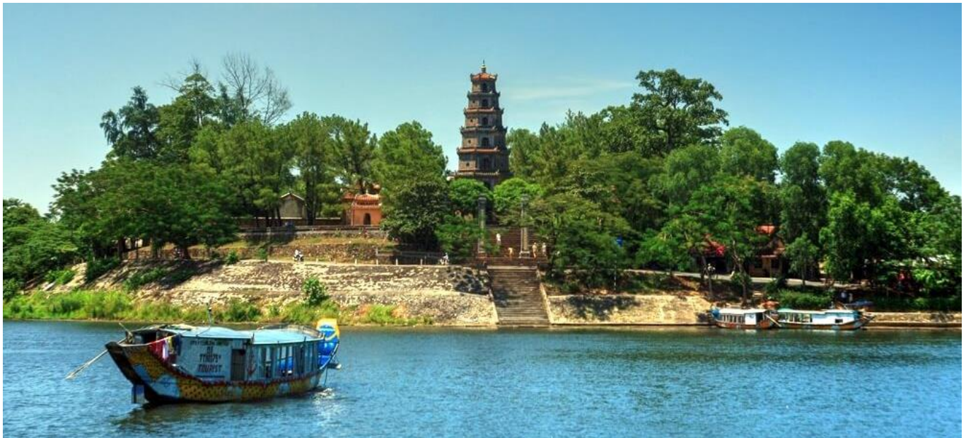
Thien Mu Pagoda

After breakfast, enjoy the boat trip ride down the Perfume River with a stop at the iconic Thien Mu Pagoda which is elegance seven – tiered octagonal tower's Hue, most widely recognized monuments. The sightseeing tour continues with a visit to the Imperial Tombs of Ming Mang . The tour end with a visit local Dong Ba Market which is close to the Imperial City. Free at leisure until take the night train to Hanoi.