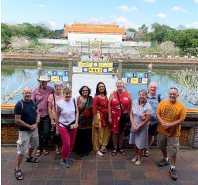
Imperial city of Hue