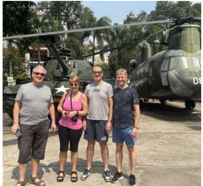
War Remnants museum