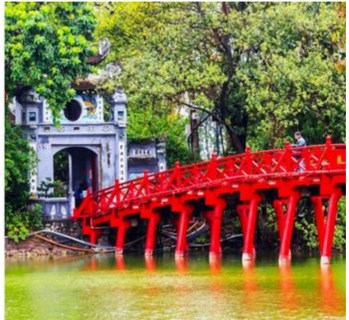
Ngoc Son Temple

Enjoy Water Puppet Show . Back hotel for relax.