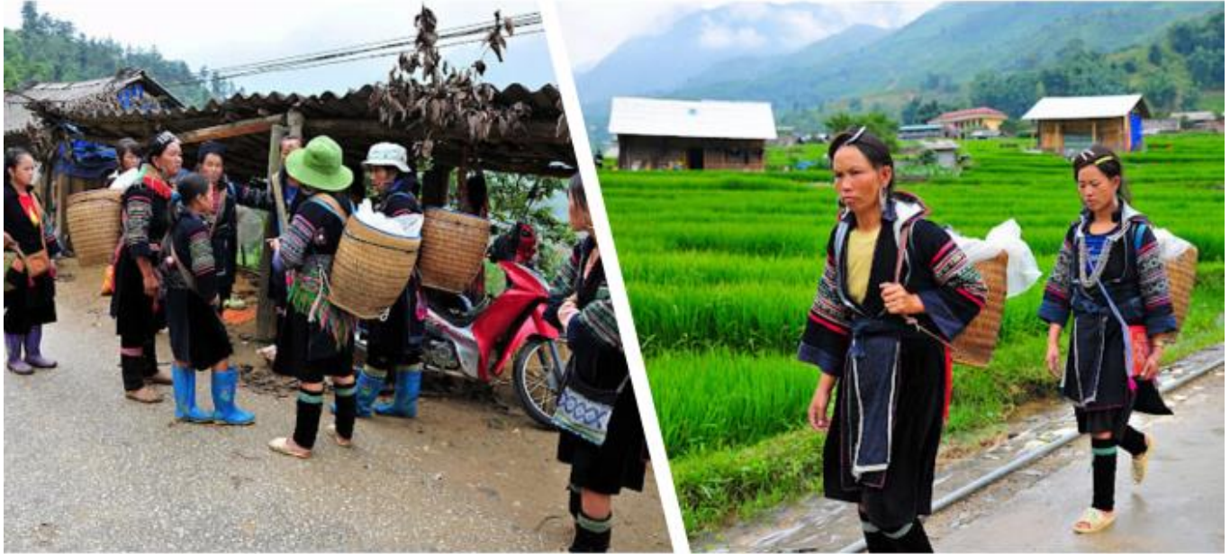
The daily life of local people in Sapa