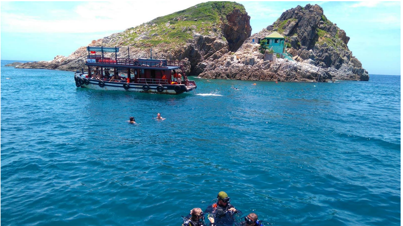
Hon Mun Island

Arrival at Nha Trang in early morning, experience the coast of Nha Trang aboard a boat as you set out in the morning for the first stop at the Tri Nguyen Aquarium . You will then head out to Hon Mun Island where you have the chance for swimming and snorkeling in the crystal clear waters. From here, continue to Hon Tam Island where you have the choice of relaxing on the beach or for the energetic - there is a choice of water sports ( expense by your own ). Lunch stop is at the fishing village of Lang Chai where there is time to explore before boarding the boat back to Nha Trang harbor. If time permits, we will visit the Po Nagar Towers, an outstanding of ancient Cham architecture and then touring around Dam Market before transfer you back to the hotel. Free at leisure.