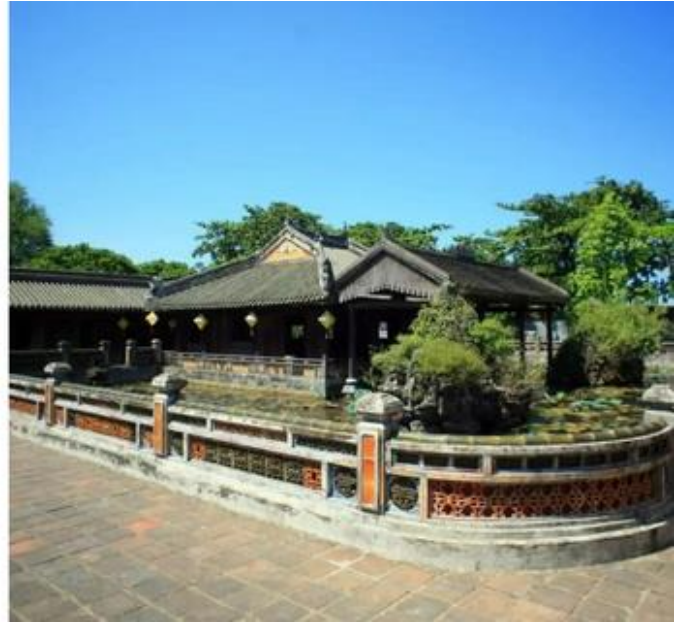
Dien Tho Residence