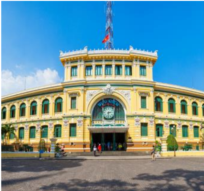
Central Post office

Afternoon at leisure, before the transfer to Saigon (known as Ho Chi Minh City) Railway Station. Embark on your private cabin on train for your first overnight journey to Nha Trang.