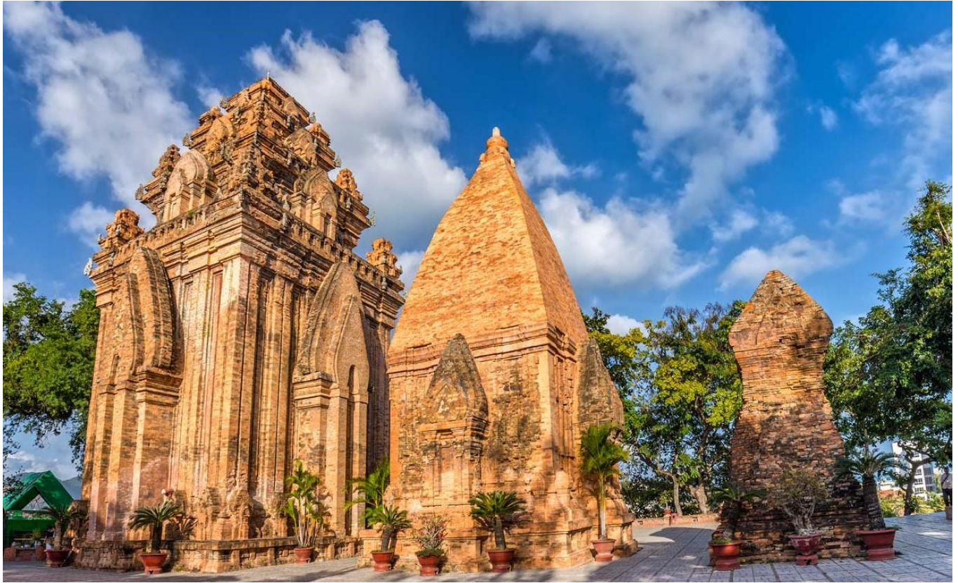
Po Nagar Cham Towers

Continue to the Po Nagar, the best preserved Cham towers in the central Vietnam.