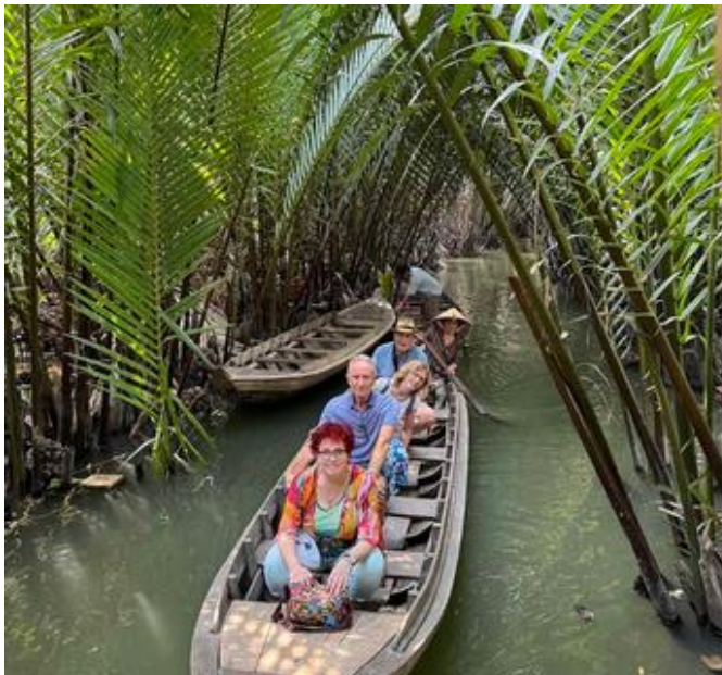
Take a boat ride on the river

In the morning, travel from Saigon to Mekong delta. Upon arrival in Ben Tre , take a boat on river.