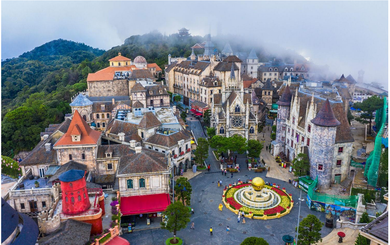
The overview of Bana Hills