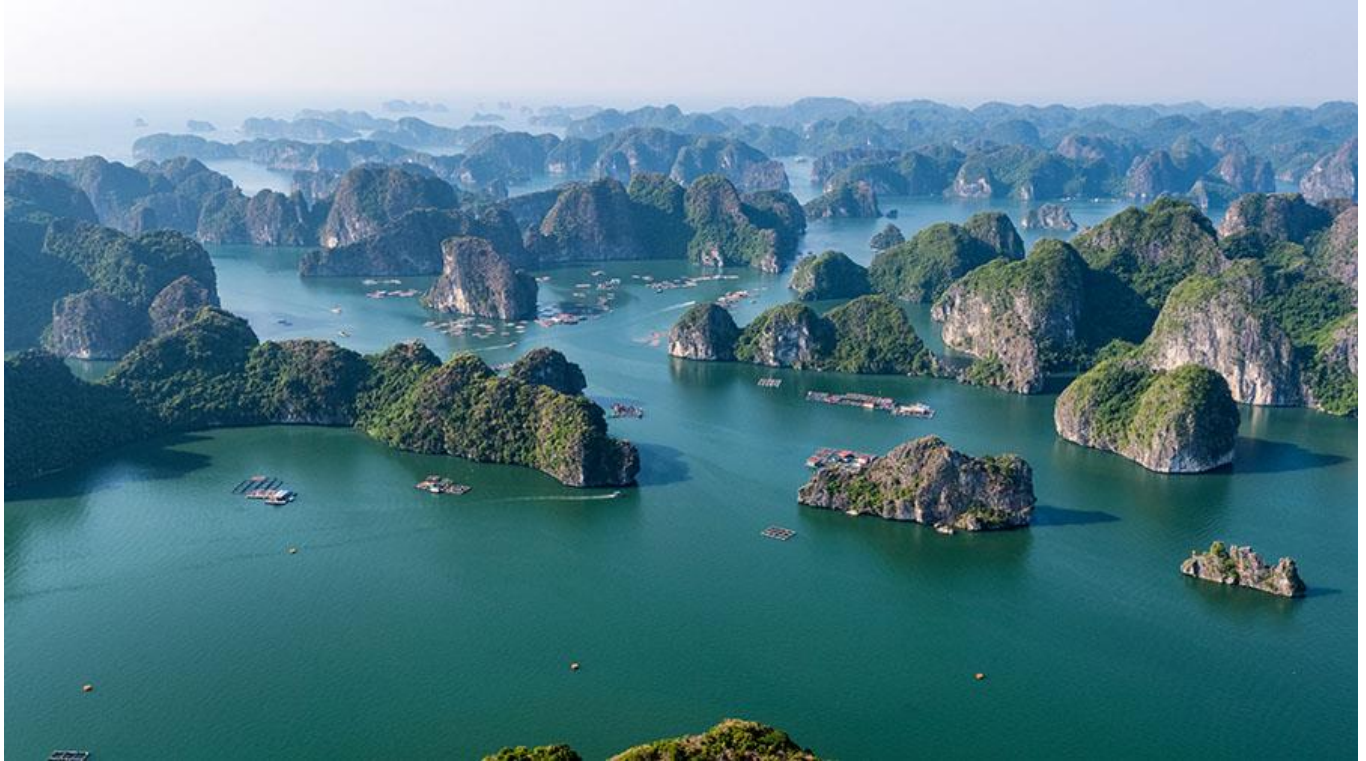
The Overview of Ha Long Bay

Along the way we will anchor for a leisurely swim in a secluded cove and an enjoyable visit to one of the many hidden grottoes beneath towering cliff.