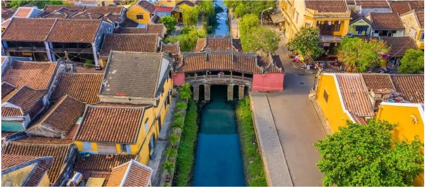
Japanese Covered Bridge Pagoda

The bridge was provided with a roof so it could be used as a shelter from rain and sun. Sa Huynh Museum located near the Japanese Covered Bridge, it contains exhibitions from the earliest period of Hoi An history. Tran Family Chapel: this house for worshipping ancestors was built about 200 years ago with donations from family members. The Tran family traces its origins to China and moved to Vietnam around 1700. The architecture of the building reflects the influence of Chinese and Japanese styles. Phuoc Kiem Assembly Hall Chinese pagoda built around 1690 and then restored and enlarged in 1900. It is typical of the Chinese clans that were established in the Hoi An area. The temple is dedicated to Thien Hau Thanh Mau (Goddess of the Sea and Protector of Sailors and Fishermen). Lantern Making workshop: Visit one of the lantern workshop in Hoi An. The framework of lantern will be made by the industry itself and clients with opportunity of making silk cloth on the lantern. Around the town we can see a numerous art galleries and tailor shops, get some made-to-order clothes if you like. Back to hotel and you will be free at leisure on the beach or wandering around the town for the rest of day.